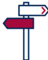
Menopause Resource Group