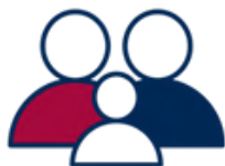
Family Friendly Group