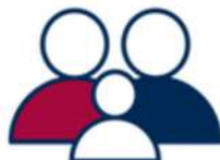
Family Friendly Group