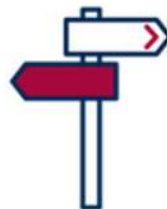
Menopause Resource Group